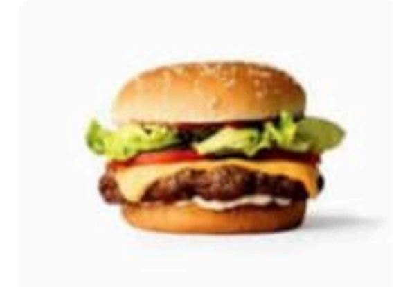
Hamburger $6.29 Add Cheese $.50