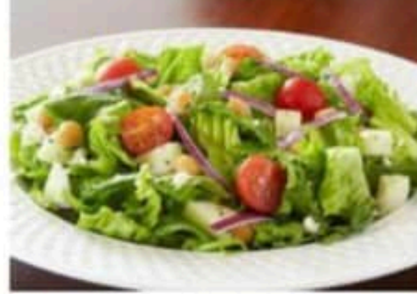
Salad $4.99 Add Chicken $2.99