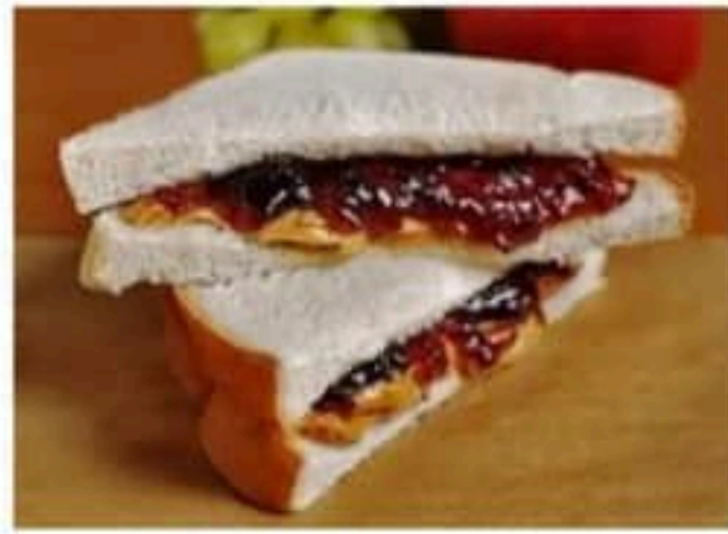
PB&J $4.99 Add banana Slices $.50