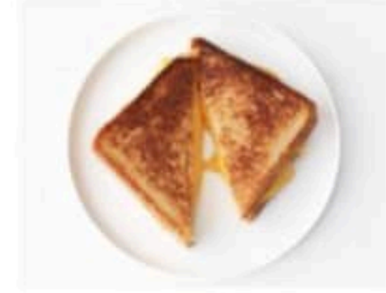
Grilled Cheese $5.99 Add Ham or Bacon $.99