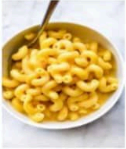
Mac and Cheese $5.29