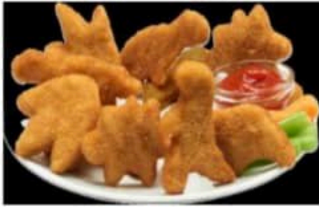
Chicken Nuggets $6.29