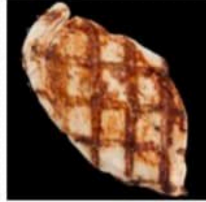
Grilled Chicken $6.29